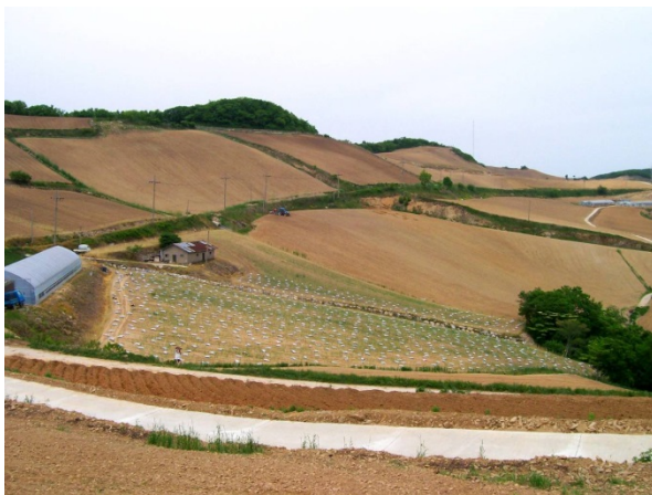
Figure 1. Dryland agricultural landscape.

This new sentence has ten words (Flanagan et al., 2002). Alternately as another example here, this is a longer sentence containing more words, twenty to be exactly precise about it. This is a sentence with ten words contained in it. Alternately as another example here, this is a longer sentence containing more words, twenty to be exactly precise about it. This is a sentence with ten words contained in it. Alternately as another example here, this is a longer sentence containing more words, twenty to be exactly precise about it. This is a sentence with ten words contained in it. Alternately as another example here, this is a longer sentence containing more words, twenty to be exactly precise about it. This is a sentence with ten words contained in it. Alternately as another example here, this is a longer sentence containing more words, twenty to be exactly precise about it. This is a sentence with ten words contained in it. Alternately as another example here, this is a longer sentence containing more words, twenty to be exactly precise about it.