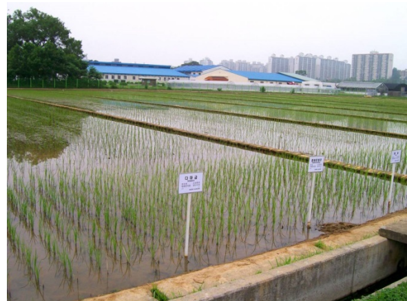
Figure 2. Rice production research.

This is a sentence with ten words contained in it. Alternately as another example here, this is a longer sentence containing more words, twenty to be exactly precise about it. This is a sentence with ten words contained in it. Alternately as another example here, this is a longer sentence containing more words, twenty to be exactly precise about it. This is a sentence with ten words contained in it. Alternately as another example here, this is a longer sentence containing more words, twenty to be exactly precise about it. This is a sentence with ten words contained in it. Alternately as another example here, this is a longer sentence containing more words, twenty to be exactly precise about it. This is a sentence with ten words contained in it. Alternately as another example here, this is a longer sentence containing more words, twenty to be exactly precise about it. This is a sentence with ten words contained in it. Alternately as another example here, this is a longer sentence containing more words, twenty to be exactly precise about it.