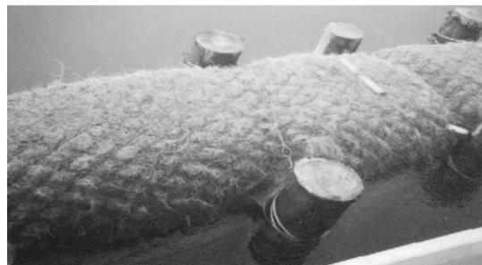
Coir logs installed in Korea