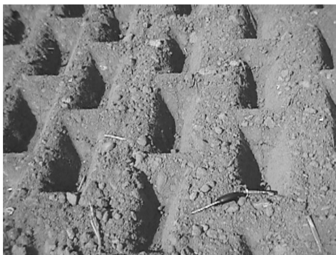
Fig.3 An Aqueeled surface following a rotoavator cultivation. Each reservoir has the capability to hold about 1 L of water. This device has shown to prevent runoff completely in a storm event up to 12 inches per hour on a 12 percent slope

arsenal of tools in addition to soil amendments to help control erosion as a low cost by treating the problem at its source while producing food for the ever growing population.