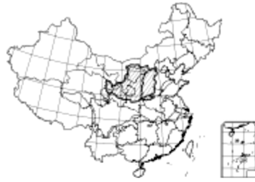
Fig. 1 Location of the loess plateau

The study area was the 623,700 square kilometre Loess Plateau in the centre of China. The Plateau includes the southern part of Ningxia Autonomous Region, the whole of Shanxi Province, Northern Shanxi Province, the eastern and central parts of Gansu Province, the southern part of the Inner Mongolia Autonomous Region, and the western part of Henan Province. It borders the Riyue Mountains to the west and the Taihang Mountains to the east; and it extends from Qinling Mountains in the south to the Yingshan Mountains in the north. Fig. 1 shows the general location of the area.