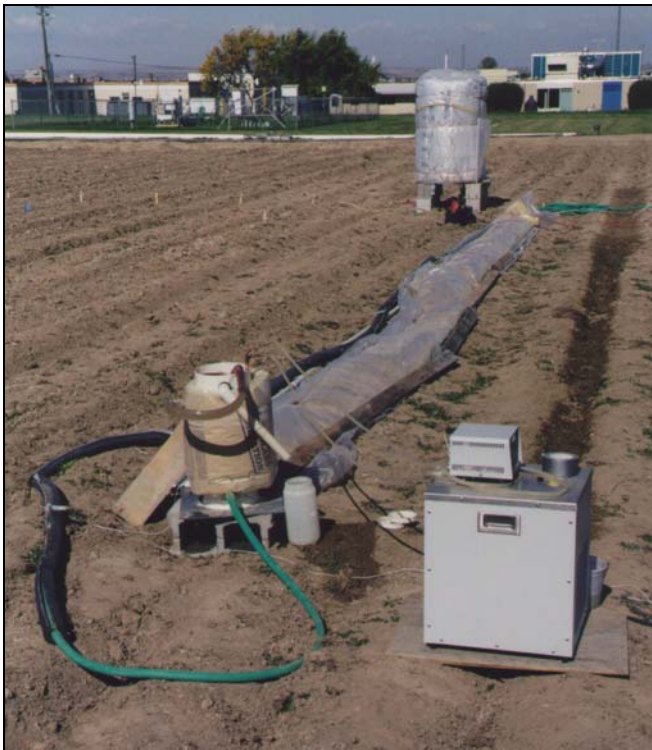
Figure 2. Recirculating furrow infiltrometer used in field experiment with modifications that permit control and monitoring of stream temperatures. Note: The insulation batting over the furrow was needed only on cool days and was not used in this study.

invariant. The main supply tank water was then refilled with enough heated irrigation water to elevate furrow stream water temperatures by 5 to 20 °C. Monitoring continued for 2 to 4 h after altering furrow stream water temperatures. The experiment was repeated over several consecutive days on five individual furrows. The data set provided six furrow responses to temperature-shift events. Infiltration was computed for the furrow-wetted perimeter.