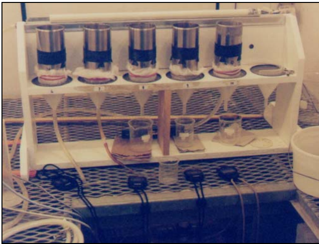
Figure 1. Constant head apparatus set up in plant growth chamber to measure the effect of temperature on hydraulic conductivity through soil columns.